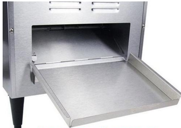
Rear discharge of toasted bread