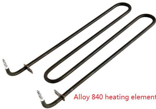
Alloy 840 heating elements